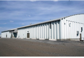
Balgonie Arena (Stardome) —Highway 364