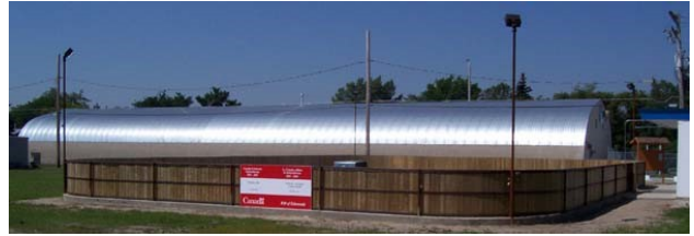
Balgonie Outdoor Rink —Main Street