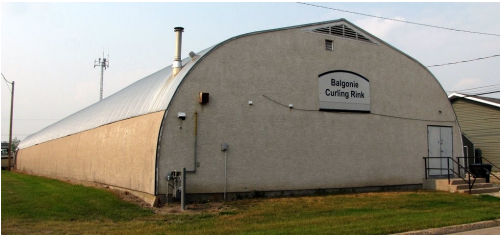
Balgonie Curling Rink —137 King Street