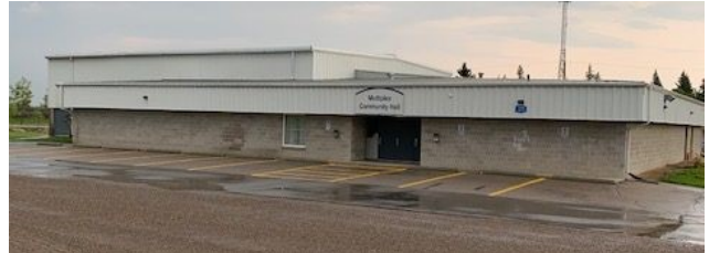
Balgonie Multiplex —Highway 364