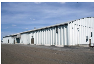
Balgonie Arena (Stardome) — 955 Highway 364