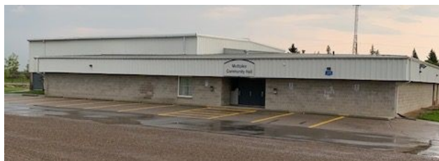
Balgonie Multiplex —1045 Highway 364