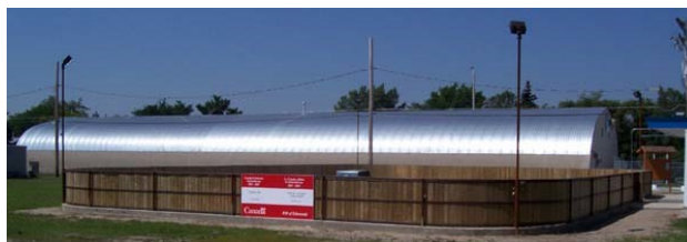
Balgonie Outdoor Rink —Main Street