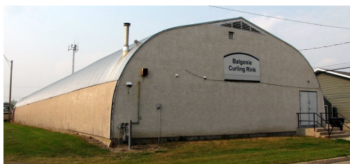
Balgonie Curling Rink —137 King Street