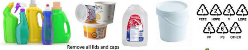
Remove all lids and caps

Plastic Containers, Plastic Milk Jugs, Milk and Juice Cartons (No "Clam Shell" Type Food Containers labelled #1) (No oil containers or chemical jugs)