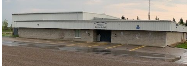
Balgonie Multiplex — 1045 Highway 364