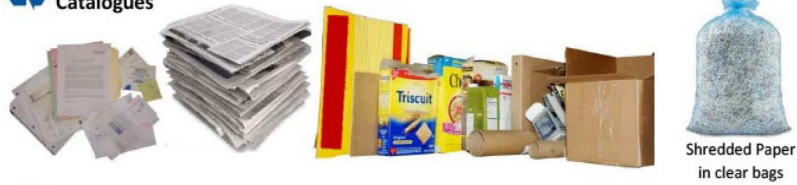
Shredded Paper in clear bags

Cardboard, Boxboard, Office Paper, Newsprint, Junk Mail, Magazines and Catalogues