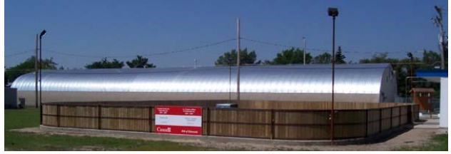
Balgonie Outdoor Rink —Main Street