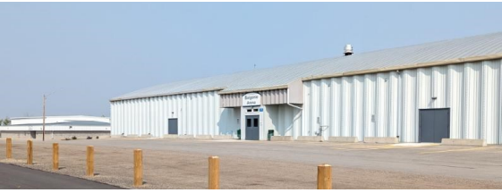
Balgonie Arena (Stardome) — 955 Highway 364