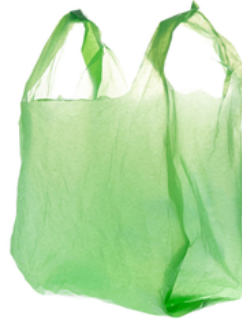
Plastic Bags & Stretch Wrap