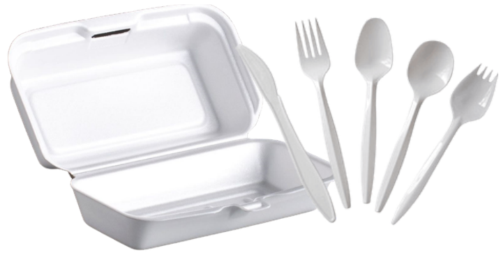
Styrofoam & Plastic Utensils