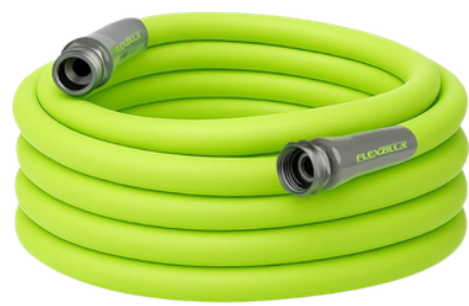
Hoses & Rubber Items