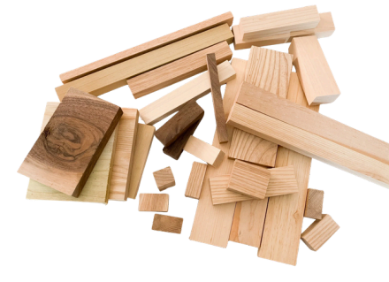
Wood & Metal Scrap