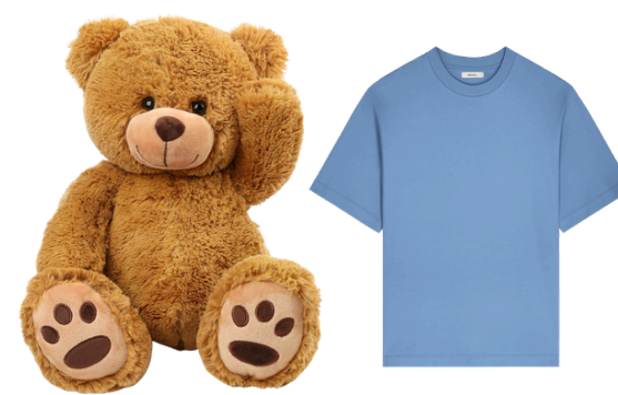
Toys & Clothing