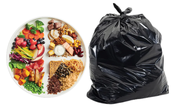
Food & Garbage