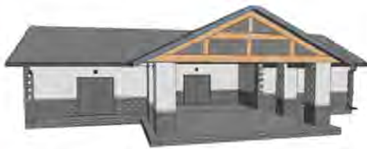
Artist's rendering of soccer centre design. Alton Tangedal Architect Ltd.