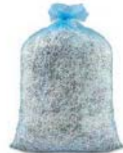
Shredded Paper in clear bags