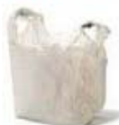
Plastic Bags and Stretch Wrap