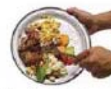
Food and Garbage