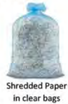
Shredded Paper in clear bags