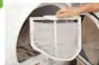
Dryer Lint & Vacuum Dust