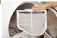
Dryer Lint & Vacuum Dust