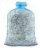
Shredded Paper in clear bags