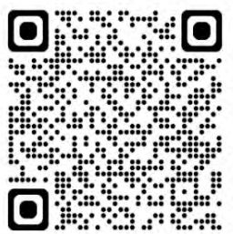
Customer Portal Registration

$375 CREDIT TOWARDS YOUR JANUARY UTILITY BILL