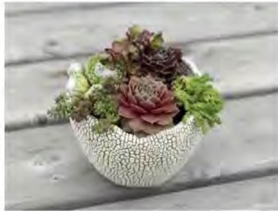
Mountain Crest Gardens

Join us for an informative session on succulents, proper planting, and care techniques with Sherwood Greenhouse staff. Participants will be provided with everything necessary to create their own succulent bowl - WCGC members are guaranteed to leave with a small door prize of your own creation!