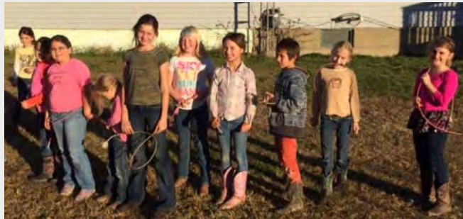
McQuilbe Multiple 4H Club

Total: $393.44 per quarter which is approx. $131.15month